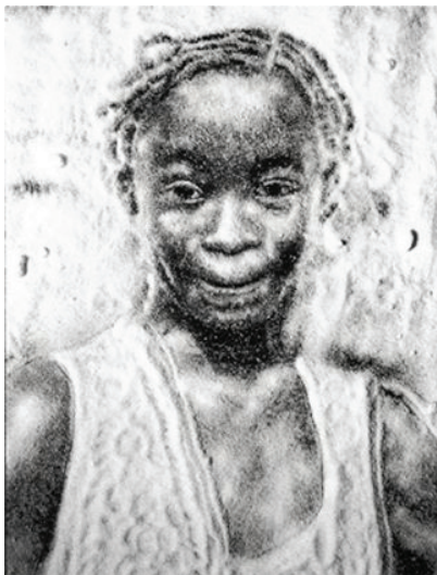
The Sugar Children