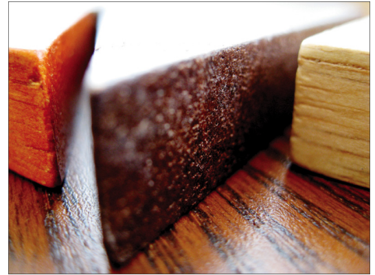
Meeta Panesar: wood