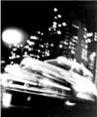
Ted Croner New York at Night series (1948)